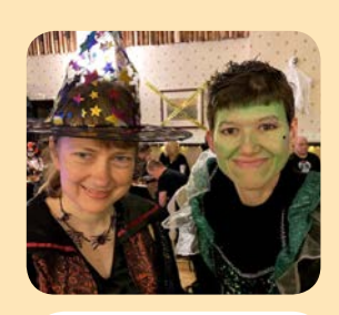
Voice for All Update: Page 8 - 11