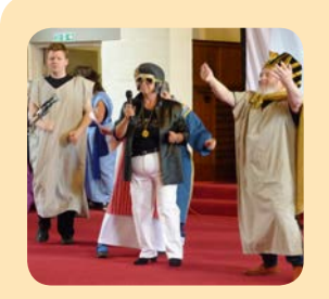
Heritage Day 2019 Continued: Page 2 & 3